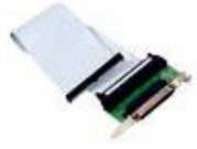
GT-400-ACC1 & ACC4